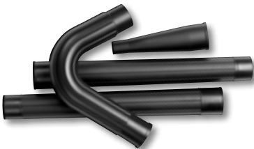
Gutter Cleaning Kit WS25051A