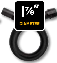
Expandable Locking Hose Expands from 2'-7' WS17821A