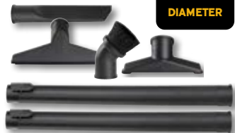
6 Piece Kit WS17856A 2 Extension Wands, Utility Nozzle, Dusting Brush, Wet Nozzle, Crevice Tool