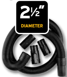
7' Dual-Flex™ Locking Hose WS25020A