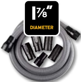
10' Contractor Locking Hose WS17823A