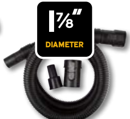
7' Locking Hose Locking tab quickly secures WS17820A