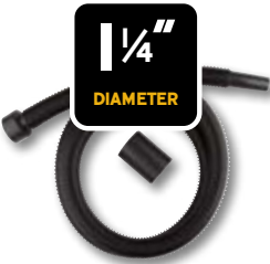
6' Hose WS12520A

The Contractor grade hose is more flexible and durable than a standard hose.