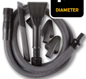
Premium Auto Cleaning Kit WS12552A