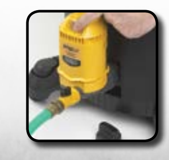
Pumps water at 10 US gallons per minute or up to 40' high!