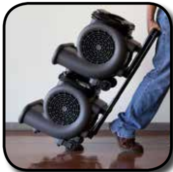
Stackable for storage or transport up to two units high

Efficient guard design allows air to be spread over larger area.